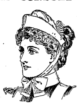
The New "Sister Dora" Cap. Made of washing Cambric, with draw strings. Can be washed as easily as a handkerchief. 1/-. Without strings, 102d.