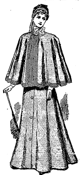
The "Rosemary" Cloak, 26/6. Made of all wool Cheviot Serge, thoroughly shrunk.

Containing List of Nursing Books, with full Discount, Collars, Caps, Bonnets, Cloaks, Midwifery Bags, Dress Baskets, Ward Shoes, Thermometers, Instruments, Diet and Temperature Charts, &c. ALL NURSES SHOULD CONSULT IT.