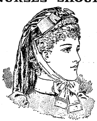
The "St. Bride's" Bonnet. Made of fine Straw with Lace and ruching, and trimmed with Ribbon, and long Silk Gossamer Fall. In black and colours, 12/6 each. Without Fall, 9/6; also The "St. Clare" Bonnet. 6/II complete.